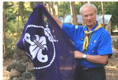
The King of Sweden at Hawequas unveiling the campsite plaque